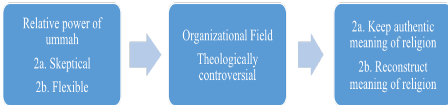
Figure 2. Ummah Dimension of Religion as Antecedent of Behavior According to Field Characteristics

Proposition 2b: The relative power of the ummah may be flexible about controversial organizational fields and may lead organizations to appeal to the norms of the field to overcome potential conflicts in an organizational field, thus reconstruct the meaning of the religion.