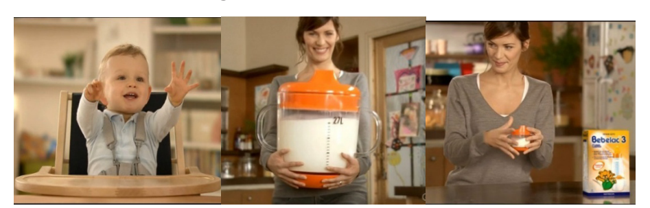
Figure 4. Bebelac Commercial

time much less in a feeding bottle (Figure 4). We analyzed all the scenes in both ads with the sign, signifier and signified concepts of Saussure. The findings for each commercial are displayed separately in Table 1 and Table 2