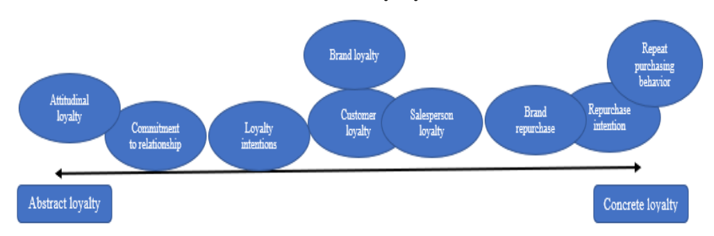
Figure 2: Distribution of The Constructs Based On The Bipolar Continuum of Abstract-Concrete Loyalty

To wrap up, a growing body of research on customer loyalty demonstrates that there are some constructs, which seem to conceptually overlap with customer loyalty to some extent, in the same or similar discipline(s). Figure 1 depicts those constructs (common aliases) along with customer loyalty. Furthermore, those common aliases can also be placed on bipolar continuum with endpoints of abstract loyalty and concrete loyalty. The abstract loyalty stands for an emotion-based representation of customer loyalty that has a weak prediction of real purchase behavior, whereas concrete loyalty refers action-based representation of customer loyalty that largely taps the real purchase behavior.